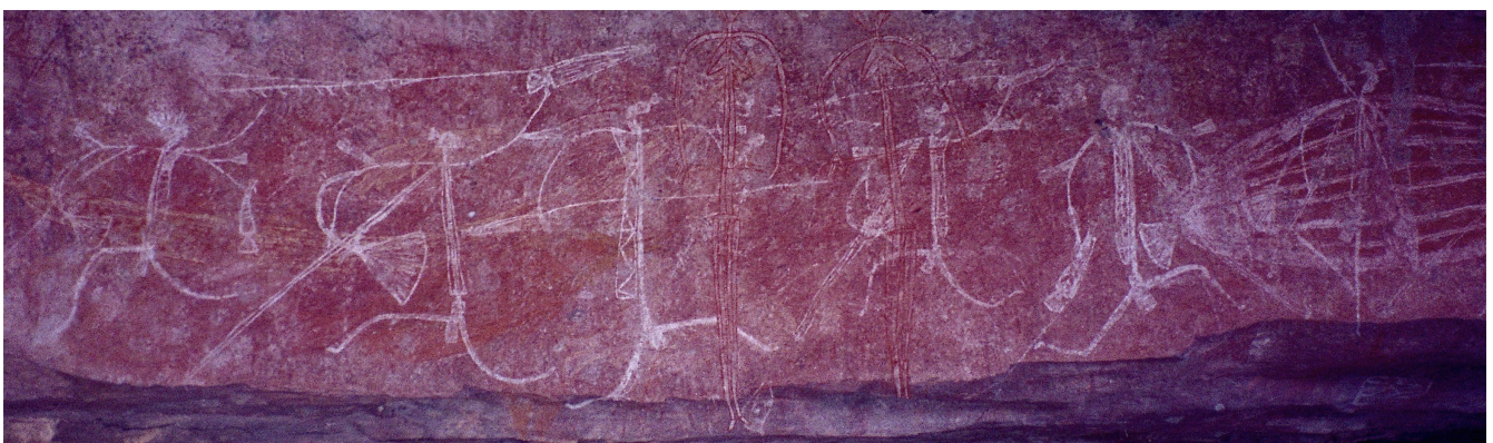
Figure 3: Rock paintings at Ubirr, Kakadu National Park, Australia

Indigenous Knowledge Systems (IKS) is a term I will use for the recognition of Indigenous Spirituality; Aboriginal Science; Philosophy; Cosmology; Kinship; Country; Culture; and The Dreaming, known as Lore (otherwise akin to "law"). Essentially, Indigenous Knowledge Systems is a term to make sense of all the components that a Western knowledge paradigm historically segregates.