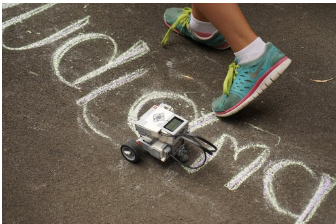
Figure 2: Detail: A robot in action, navigating the chalk-drawn map. The map was composed of region boundaries with place-names (e.g. Dharug; Dharawal) written inside them, and also pictures of geographical features (e.g. mountains) Photo: Angie Abdilla, 2014

Building different robots and enabling different coding exercises within the program was contextualised through Indigenous mapping. In the 'Mapping of Country' exercise, the children drew Aboriginal Sydney and its boundary lines with chalk in an outdoor courtyard. The emphasis was on the protocols pertaining to the country on which we stood that day: Eora Nation, home to the Gadigal people, and on our interrelatedness with everything through respect for country. The map included the neighbouring nations: Dharug to the west, Dharawal to the southwest, Guringai to the north. The ways in which crossing boundaries is acknowledged through protocols, and the ceremonies central to Songlines' continuation through country and across territories, were related to the protocols of code. The children needed to program their robots to track a coded course, which crossed through courtyard country and chalk-drawn nation boundaries.